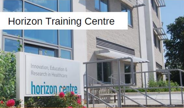
Horizon Training Centre

Torbay and South Devon NHS Foundation Trust South Devon Upper GI Unit